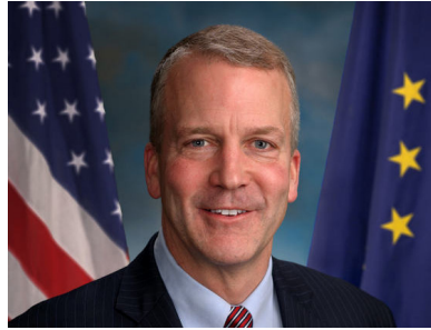
U.S. Senator Dan Sullivan