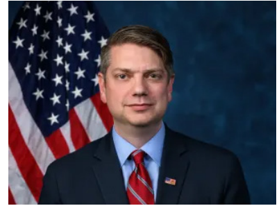
U.S. Congressman Nick Begich