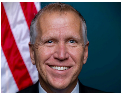
U.S. Senator Thom Tillis