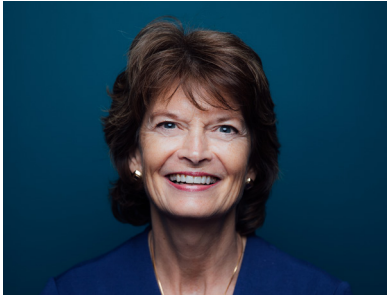
U.S. Senator Lisa Murkowski