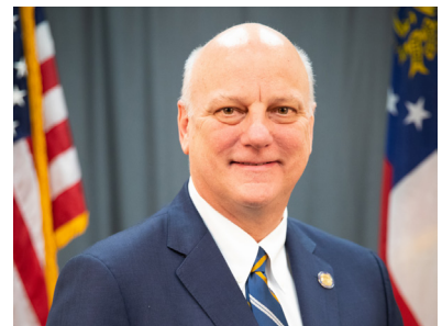
U.S. Treasurer Brandon Beach